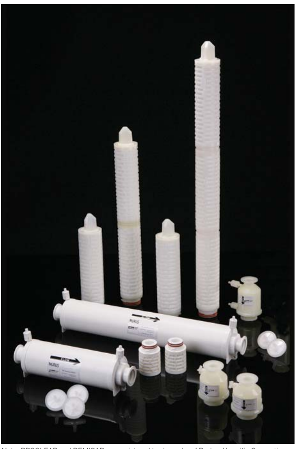
Note: PROCLEAR and DEMICAP are registered trademarks of Parker Hannifin Coporation.