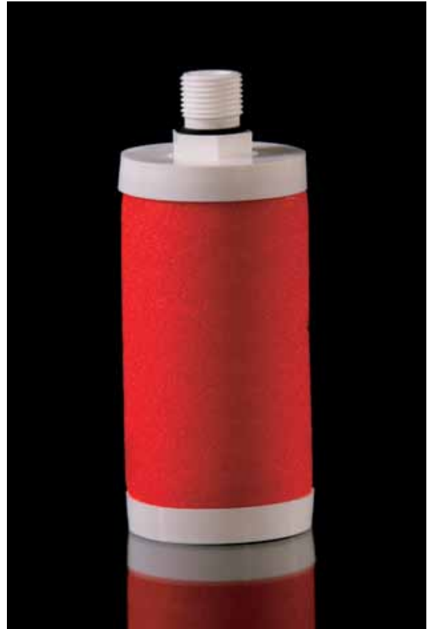
Note: TETPOR is a registered trademark of Parker domnick hunter